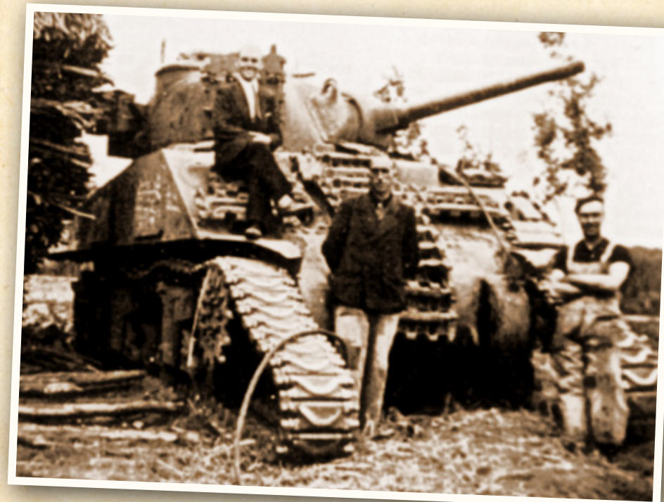
Another Sherman V tank from the South Alberta Tank Regiment with Panther tracks welded to the hull for extra protection.

Besides removing the tracks, the LAD scroungers stripped the Tiger tank hulks of anything they considered potentially useful in the repair of the recovered tanks. One Tiger tank, tactical number 312, located less than a half mile from the orchards at St Aignan, had the armour along the entire left side of the hull torch-cut away for use, either as supplemental armour or for covering battle damaged areas on Sherman tanks. It probably also took only a few minutes for one of the LAD welders to remove the rear mounted gun barrel rest off Tiger No.007 by torch cutting the welds on the base blocks and removing it from the top of the rear hull plate. These gun rests were taken as replacements for damaged gun rests on recovered 17-pdr Sherman tanks.