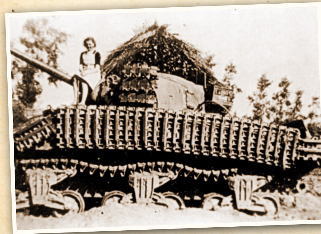
Sherman V tanks from the South Alberta Tank Regiment were both knocked out at Moerbrugge in Belgium in September 1944. The tracks welded to the hulls and turrets were taken from Panther tanks.

* The RCEME units began recovering tanks and other vehicles from the battlefield, as well as salvaging usable parts from the many wrecks. Spare parts for tanks and other vehicles were often slow to reach the front line repair and recovery units. As a result, both Allied and German tank wrecks were stripped of any potentially useful parts and pieces by the tank recovery teams. One RCEME unit reported many 'buckshee' (free vehicles which were not listed on the unit's inventory). German vehicles were being recovered and were used in their operations. 8