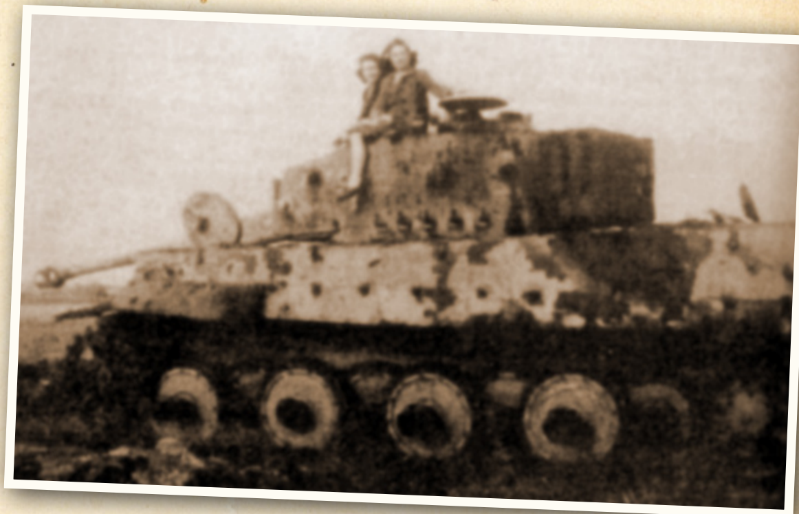
After the battle in which Tiger No.314 was lost, this photos documents the removal of the outer rubber tyre road wheels. This practice was likely carried out by the local residents. The wheels were either sold for scrap or retained for farm use.

The photographs of Tigers No.007, 009, 312 and 314, whether taken in August 1944 or in the Spring of 1945, show all four tanks had been subjected to considerable